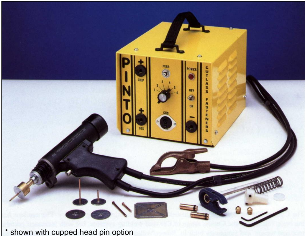
* shown with cupped head pin option

One of the new Cutlass range of light, portable, powerful and reliable stud welding systems. Built specifically for the insulation contractor as a small, lightweight and robust pin welding system...but equally at home in the "Job Shop" as a compact and very portable pin or stud welding system.